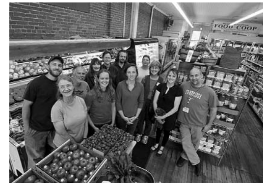
2010 Market Staff

* A superworker is a member who works 2 hours/week for the Market and earns a 10% discount on all purchases for two adults in a household.